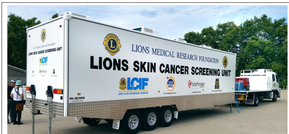
The new Mobile Skin Cancer Screening Unit