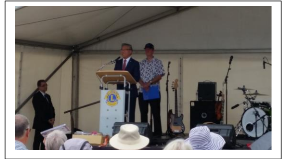
His Excellency, the Governor of South Australia addressing the crowd and launching the new Unit